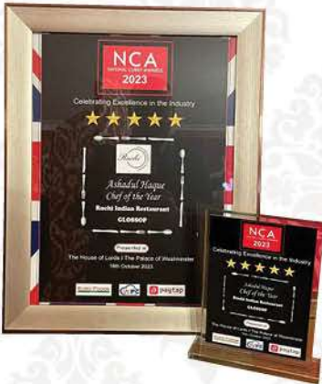
AWARD WINNING CHEF OF THE YEAR