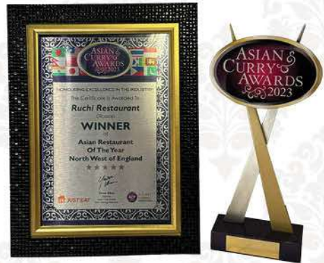
AWARD WINNING RESTAURANT OF THE YEAR NORTH WEST OF ENGLAND